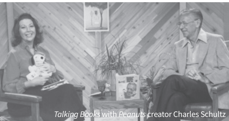
Talking Books with Peanuts creator Charles Schultz

Local interest and participation in community television was high from the beginning. Today, our public access station continues to empower people to make media that matters.