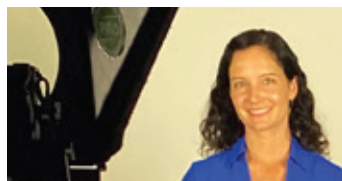
The Giving List