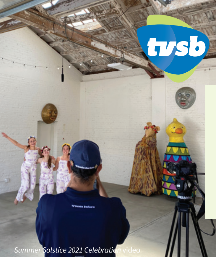
Summer Solstice 2021 Celebration video

329 S Salinas St Santa Barbara, CA 93103 805.571.1721 info@tvsb.tv