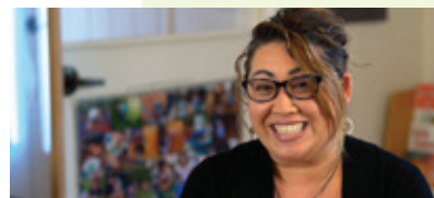
Storyteller Children's Center