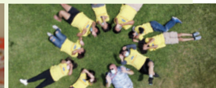
Fun in the Sun